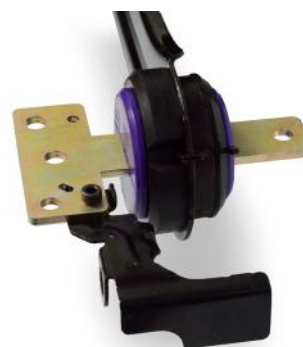
Figure 4 - fitted image of PFR19-1917