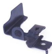
Figure 1 - Retain small metal bracket from original bush for refitting to new bush