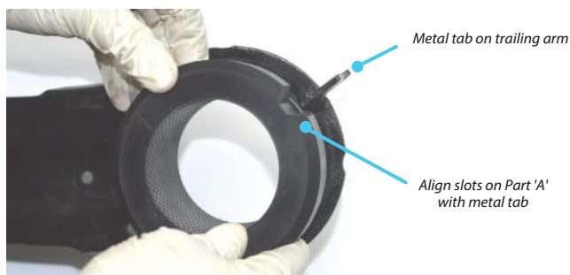
Figure 3 - Align slots on part A with welded tab on trailing arm