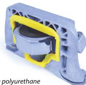
Figure 4 - fitted image of the polyurethane part in the engine mount